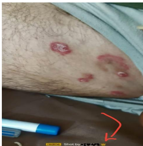
Figure 01 Retrospective confirmation