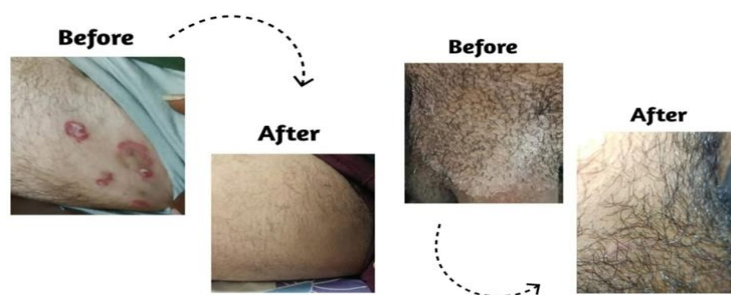
Figure 02 Before and after treatment