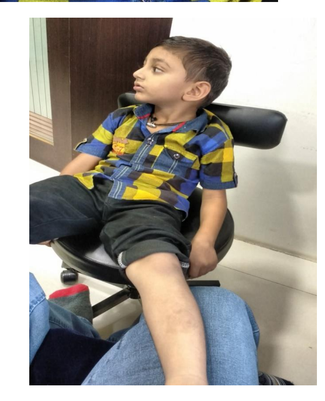
A. J. SAVLA HOMOEOPATHIC NATIONAL JOURNAL Volume: 1 (2023),Issue:1